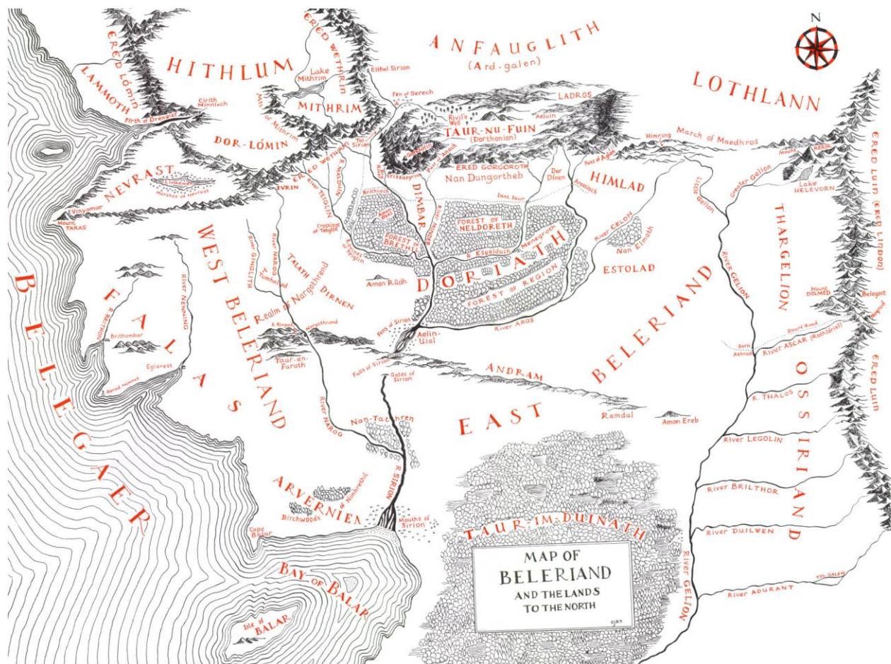
Figure 1: The map of Beleriand during the First Age (Theonering.com, Map of Beleriand during the First Age)